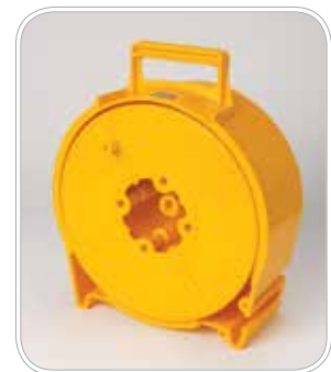
Optional Cable Reel.